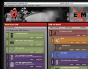
BUILD YOUR EXM – PAGE 3