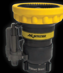
SM500E – PAGE 3