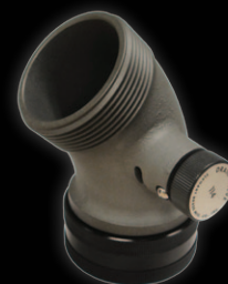
105A HIGH-RISE ELBOW – PAGE 4