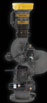
SCORPION™ EXM – PAGE 2